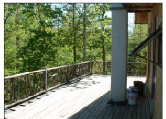
North deck space in front of apartment